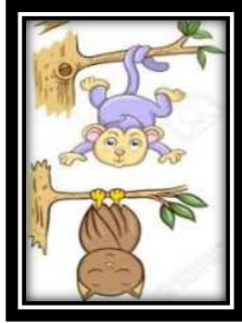
MONKEY and BAT

4. Some animals live on trees. They are bat , monkey , etc.